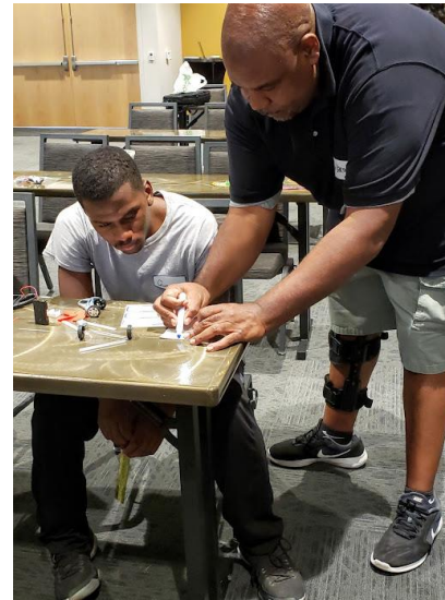
EV Workshop with Saint Augustine’s University – ETS Program

“Thanks for your time with the SAU ETS Program and it's participants. Based on the positive feedback from students and staff, I have already mentioned to the Program Coordinators to plan to utilize you in the 2019-20 school year. Thanks for everything.”