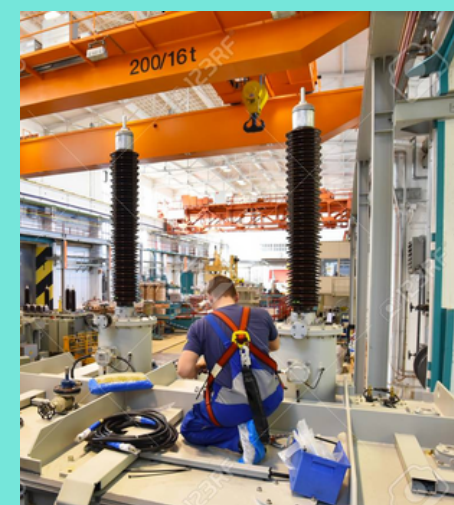
Development and Manufacturing Teams