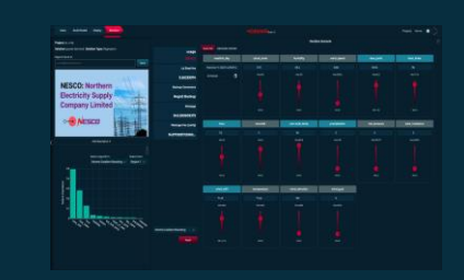
US DOE Award Winner Robotic AI Solution Builder for Energy Solutions