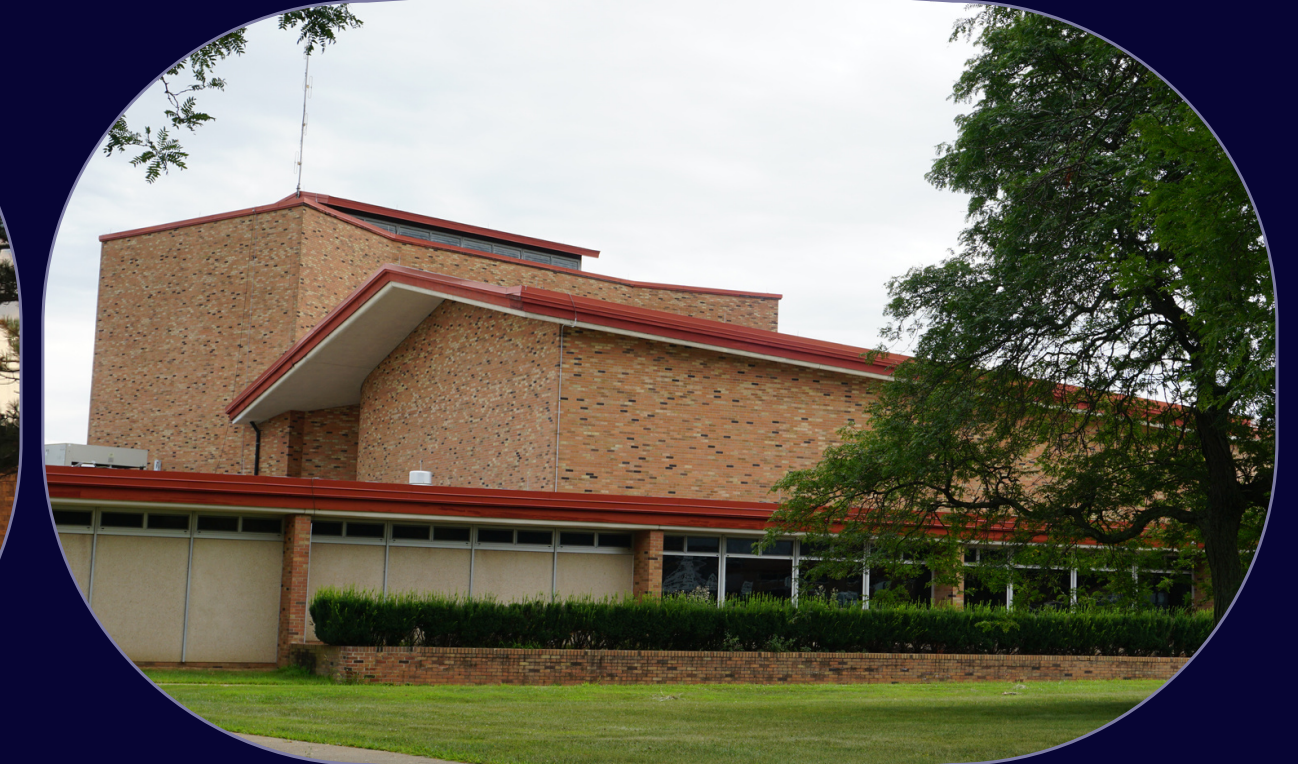
Senior High School (9-12)