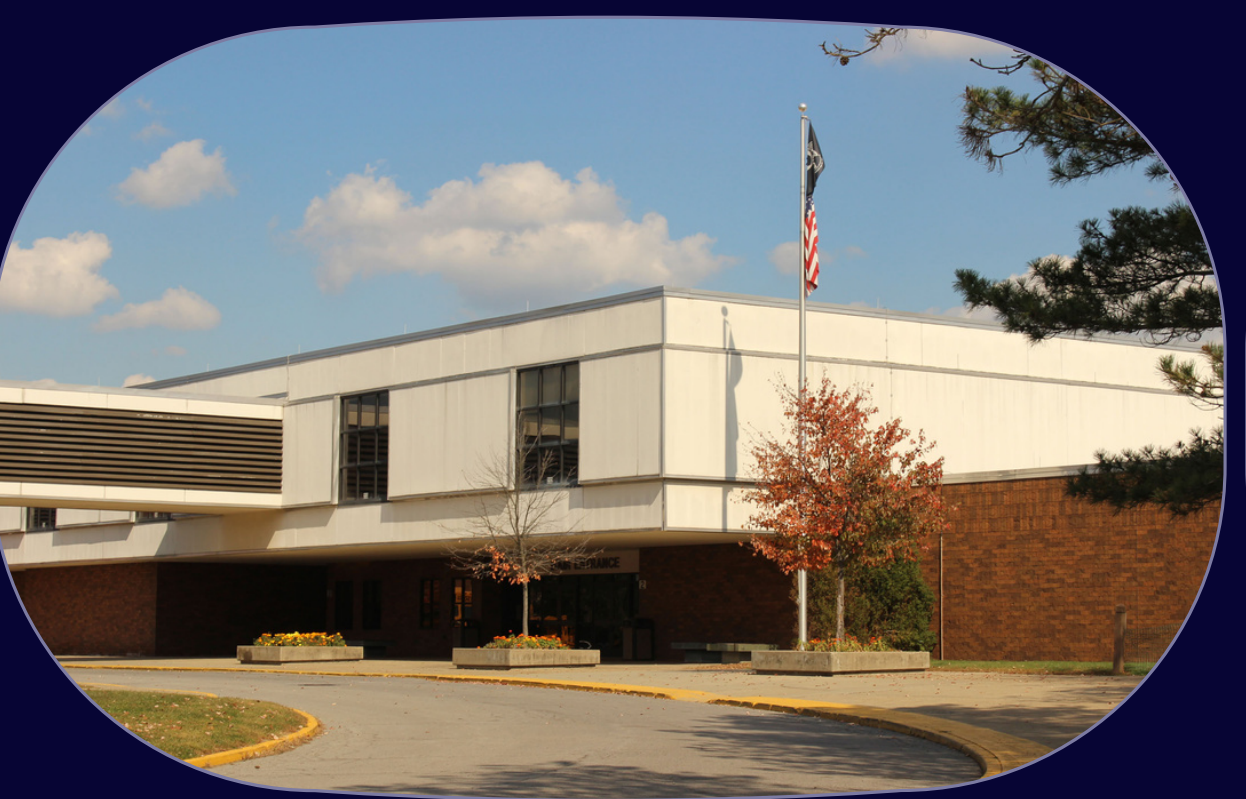
Intermediate High School (6-8)