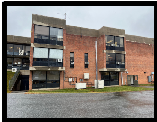
Entrance to Mount Anthony Union High School. This 1968 award winning building needs an energy assessment to facilitate future energy efficiency work.

Mount Anthony Union High School, Arlington Memorial High School, & Molly Stark School