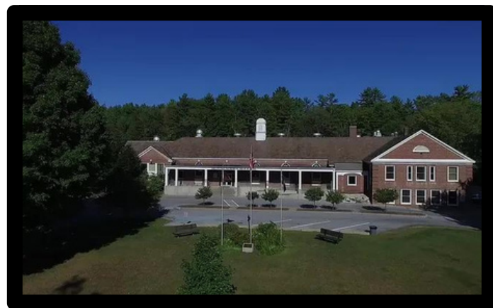
Arlington Memorial High School, built in 1941, is a historic building but needs care in order to become energy efficient. It burned approximately 20,000 gallons of oil in 2022.