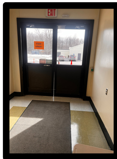
Molly Stark was built in 1958. Many of the doors are not sealed and you can see day light through them.