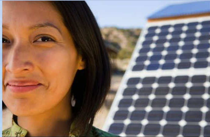
One of the sunniest areas of the country