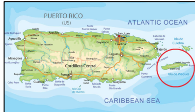
Figure 1. Map depicting Vieques, PR

The partnership between Community Through Colors and Cornell University aims to bolster the Vieques energy grid by combining solar energy with hydrogen fuel cells to create an innovative, resilient, and replicable energy solution. Our mission is to provide the rural and underserved frontline island community with clean, resilient, and equitable power generation to lower its energy burden, reduce greenhouse gas emissions, improve community health, and increase energy efficiency through the development of microgrids and energy education programs.