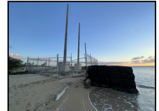
Figure 2. Exposed submarine cable