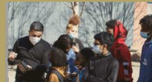
Educating Grade School Students on Technology