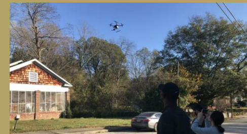
Fast, Cheap, Safe and Accurate Drone-based Analytics