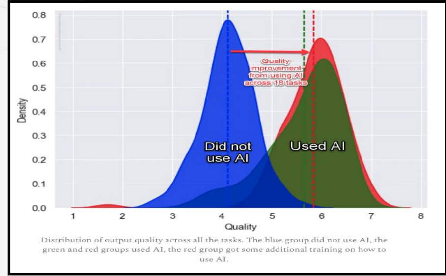
Figure 2. Distribution of output quality across among Boston Consulting Group consultants using and not using AI (n=758).