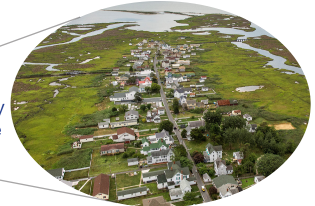
Tangier Island, only accessible by ferry