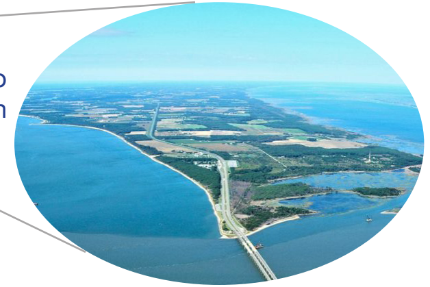
Southern entrance to the Eastern Shore