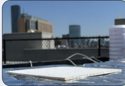
Ultra-reflective nanoscale hydroxyapatite