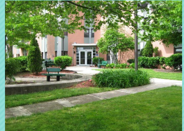
Kennedy Arms, Elizabeth, NJ

The team will work together to support Kennedy Arms residents and neighbors to assess, prioritize, and pursue clean energy solutions to improve quality of life in their community.