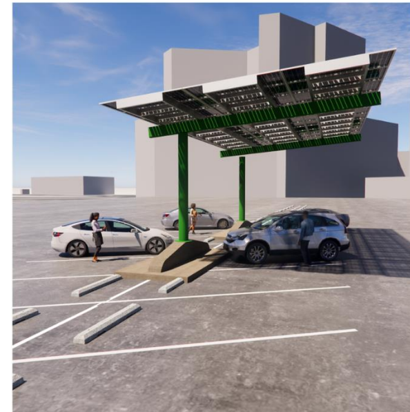
Wave 22 (22.5kW) covering 5 spaces