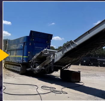
Processed through shredder with 2" screen