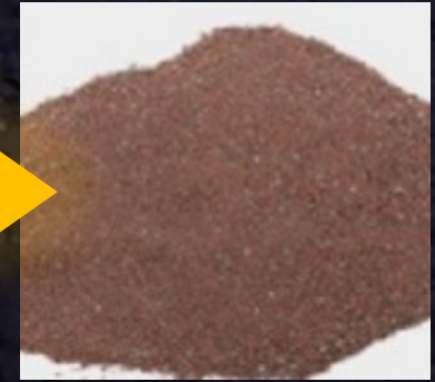
Metal Material Separated By Vibratory Shaker