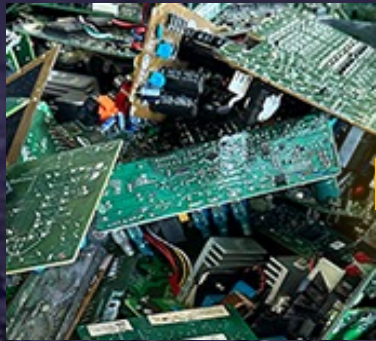
Printed Circuit Boards