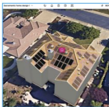
Instant Project Design and Financial Savings + Green Impact Projections