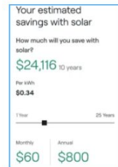
Interactive Proposal and Contract with Integrated Financing via Local Lenders