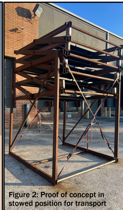
Figure 2: Proof of concept in stowed position for transport