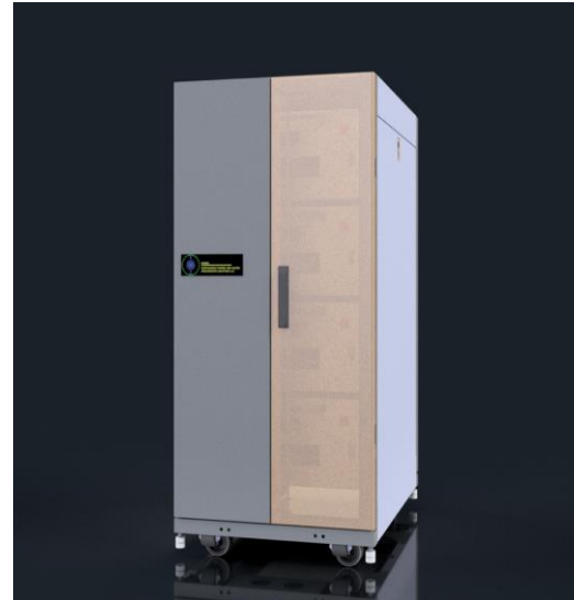
Main Unit: 44KWH