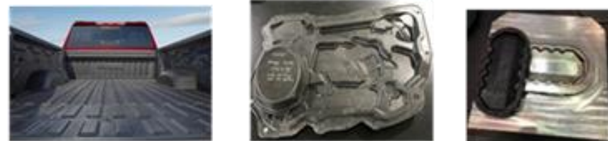
Value added composite part