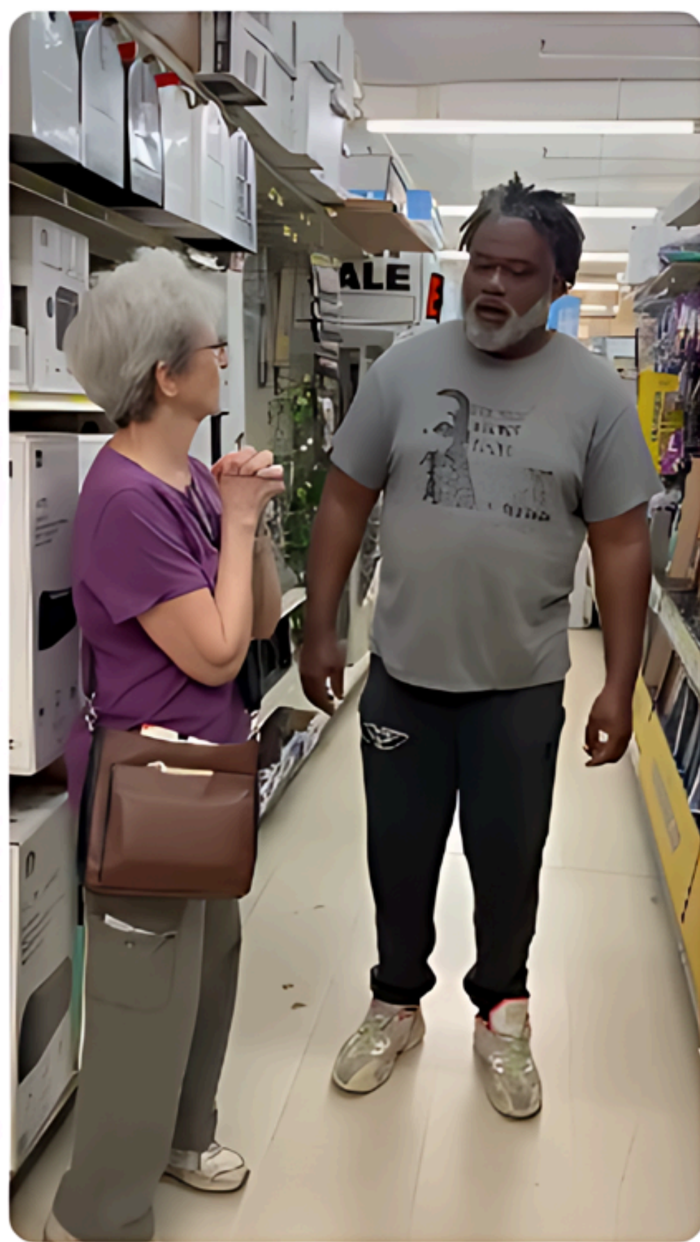
What about window seals?