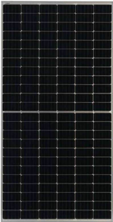
Mono- PERC Half-cell, Back Contact Cell (IBC)