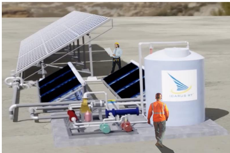
Fig. 3 – 3D rendition of an Icarus commercial pilot project.

Icarus is also prospecting pilot projects with commercial scale partners to advance commercialization of our technology (see Fig. 3). The American-Made Network has the potential to connect us with commercial partners who are open to pilot projects ranging between 50 to 200 kW. Icarus is specially interested in pairing with hospitals, convention centers, and other commercial buildings with existing PV systems or in the process of having one installed. Icarus' plan is to install its hybrid solar PV/thermal plus storage system to boost daytime PV energy production and generate on-demand hot water and/or power for end-users at a lower cost than current state of the art PV plus storage systems. These pilot projects will validate the performance of Icarus' solar plus storage system in a commercial setting and advance it from TRL 8 to TRL 9.