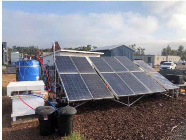
Fig. 1 – Icarus’ solar lab at the UCSD Englekirk Structural Engineering Facility.

Icarus seeks the guidance of American manufacturing experts such as NREL’s Advanced Manufacturing Team, Xometry, and the Wilton E. Scott Institute for Energy Innovation to develop large-scale manufacturing plans for Icarus’ solar panel heat extractor (see Fig. 2), the energy storage system, and monitoring & control system. With the help of manufacturing connectors, we will be able to scale up production of the Icarus systems. By manufacturing components at high volumes, Icarus will lower the costs for our end-users and make solar plus storage easier to purchase.