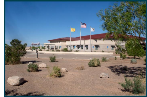
Test location: the BGNDRF Facility in Alamogordo, New Mexico