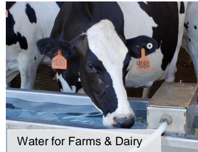
Water for Farms & Dairy