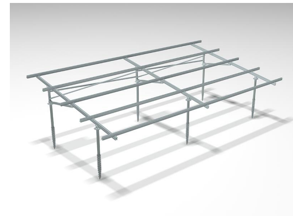
Composite polymer racking