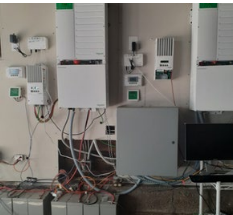
Helios Edge lab connecting DERs

15 years of experience in designing electronic solutions. Graduated with degree from University of Montenegro in Maritime Communications and automatic.