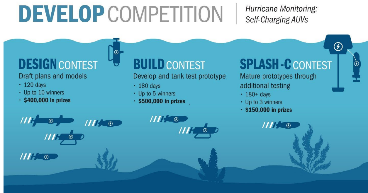
Figure 1. Ocean Observing Prize timeline

The DEVELOP competition comprises three separate contests: DESIGN (closed), BUILD (closed), and SPLASH-C.