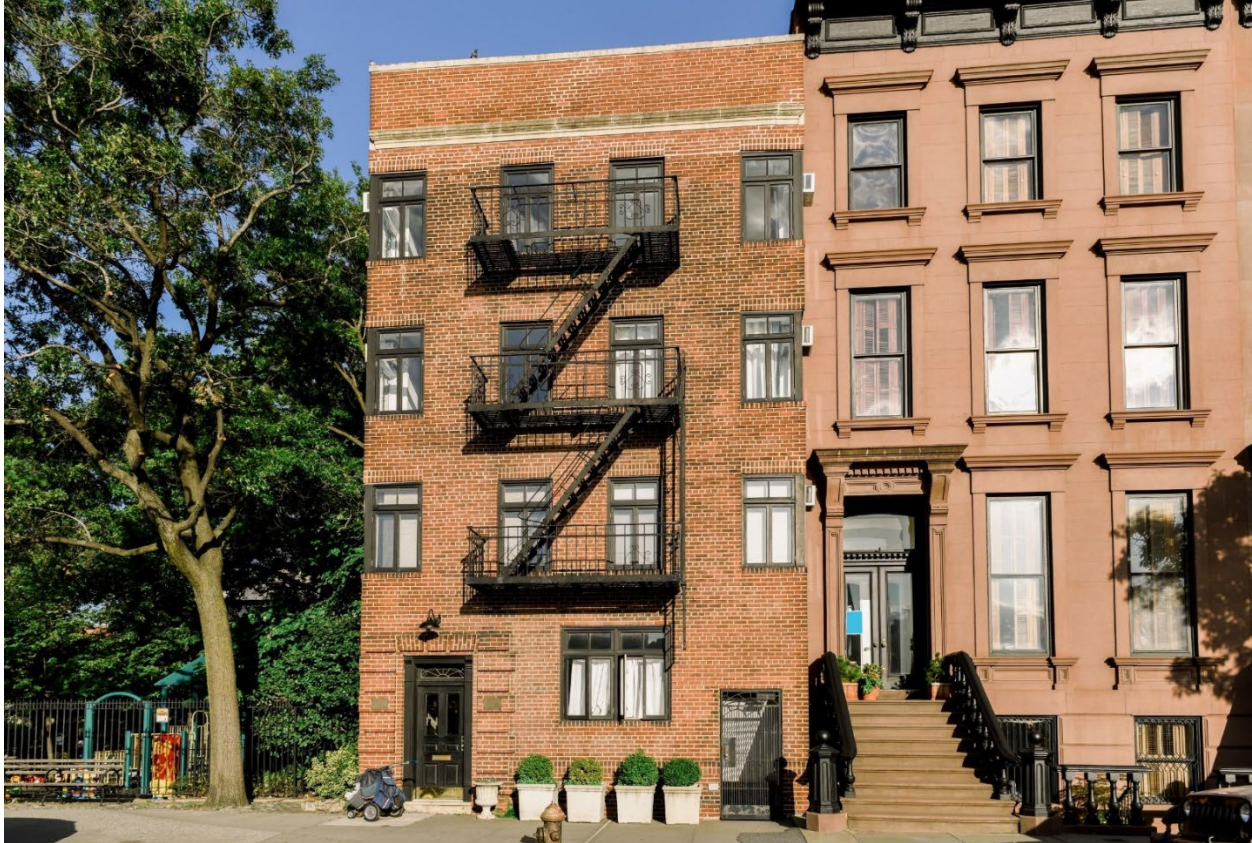
Figure 3. Exterior image of a low-rise multi-family building.