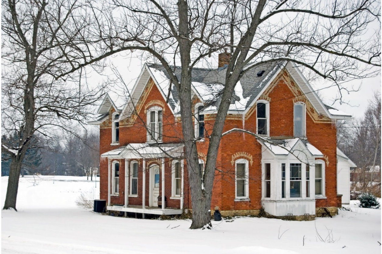
Figure 5. Example single-family detached dwelling in a cold climate.