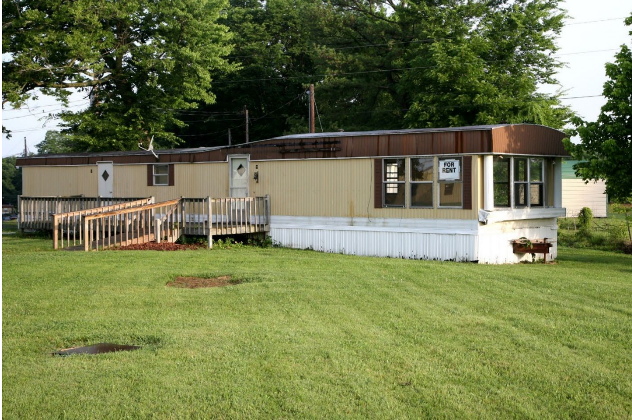
Figure 2. Example of a single-section HUD code home.