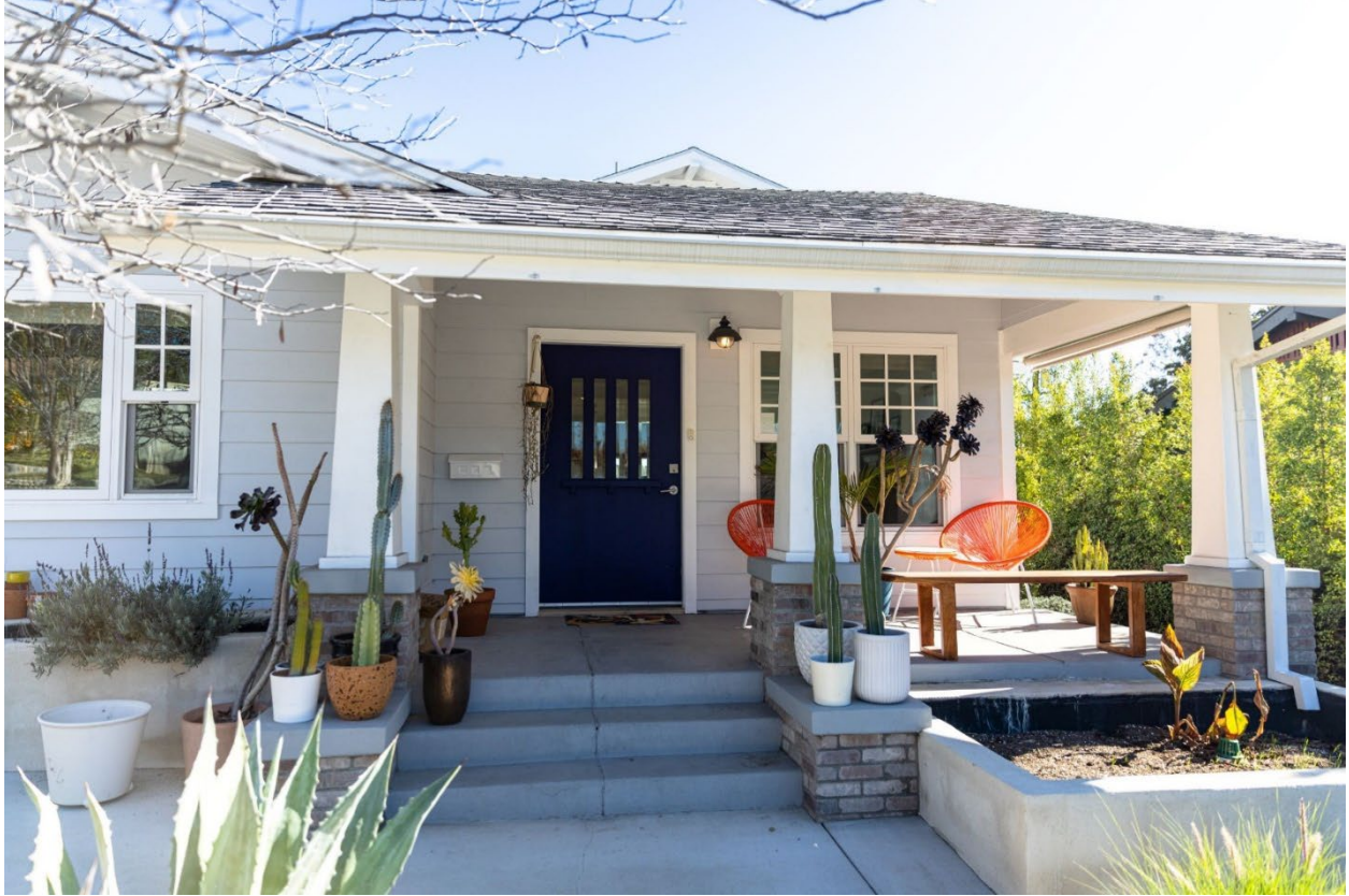
Figure 4. Example single-family detached home in a mild climate.