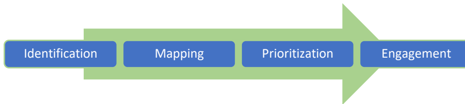
Figure 1. Stakeholder analysis

The goal of the stakeholder analysis is to identify and map the important stakeholders across several policy sectors, assess their potential effect on the geothermal project's decision-making framework, and show the interdependencies across them.