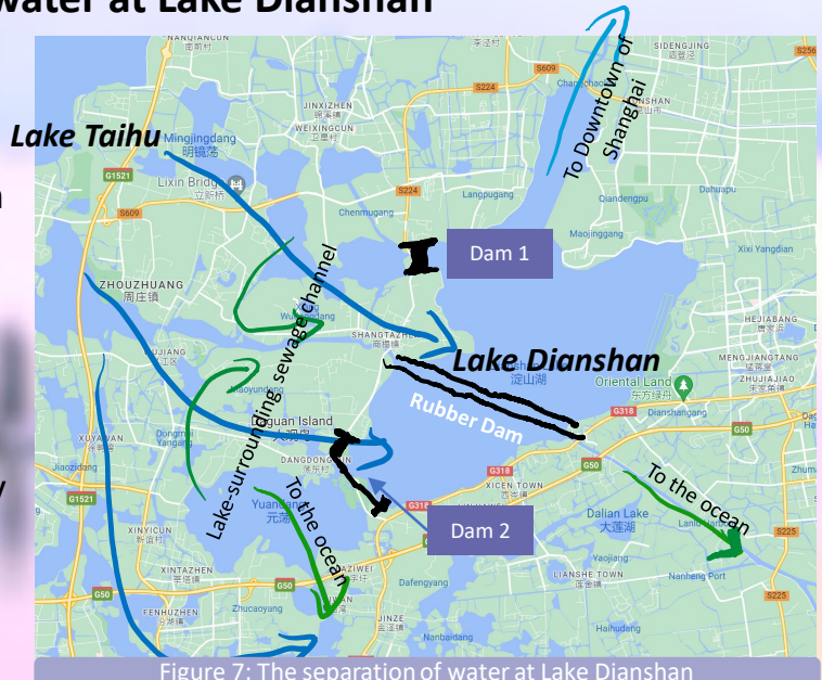
Figure 7: The separation of water at Lake Dianshan

We use SPP (Separation, Protection, Prevention) principle to deal with the change of water quality. When high-quality water comes, the rubber dam will be drained, and high-quality water enters. When sewage occurs, the rubber dam will be filled with air (and/or water) immediately and the sewage will be discharged from the lake-surrounding sewage channel.