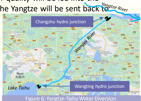
Figure 6: Yangtze-Taihu Water Diversion

After the green corridor, water with lower quality will be led into the Yangtze River, while cleaner water from the Yangtze will be sent back to Lake Taihu through the Wangyu River. We try to centralize sewage discharge at the lowest level of Yangtze River at the year, during which close Wangting hydro junction and open Changshu hydro junction. The direction of Wangyu River will reverse, and sewage from the west will be discharged into the Yangtze River and then the ocean.